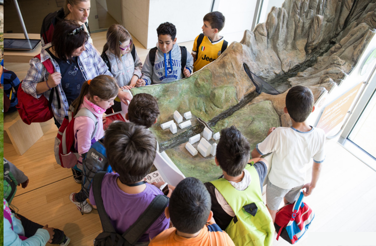
School Group at MUSE