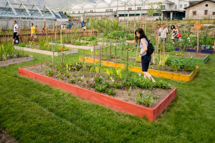
Vegetable Plots at MUSE