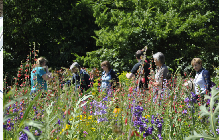
Enjoying a Botanical Garden Visit